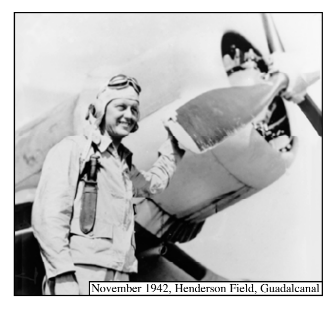
Archie G. Donahue, Colonel, USMCR (Ret.) "Archie"

Date of Designation: December 1941 NA # 09018 Dates of Active Duty: 2 March 1941 - 1 May 1958 Retired from Reserves Total Flight Hours: 4,200 Carrier/Ship Landings: Fixed wing: 110 Approximate Flight Hours: